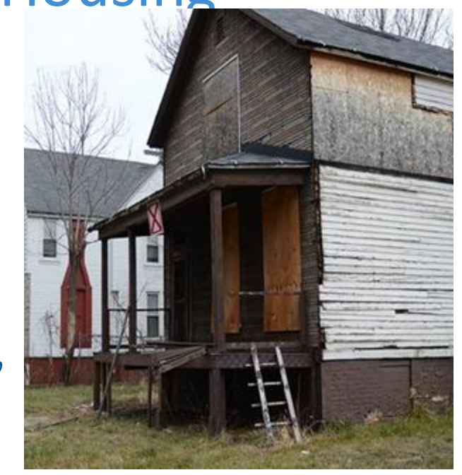
Englewood-Chicago: "The Duality of Chicago." The Corner Side Yard

Perhaps one of the largest benefits of mixed Income housing is the decrease in concentrated areas of poverty, which have shown to lead to an increase of crime , mental health struggles, and violence. Residents living in concentrated areas of poverty have an overall lower quality of life, as they are unable to access vital resources and services that are much more abundant in middle and higher class neighborhoods. *