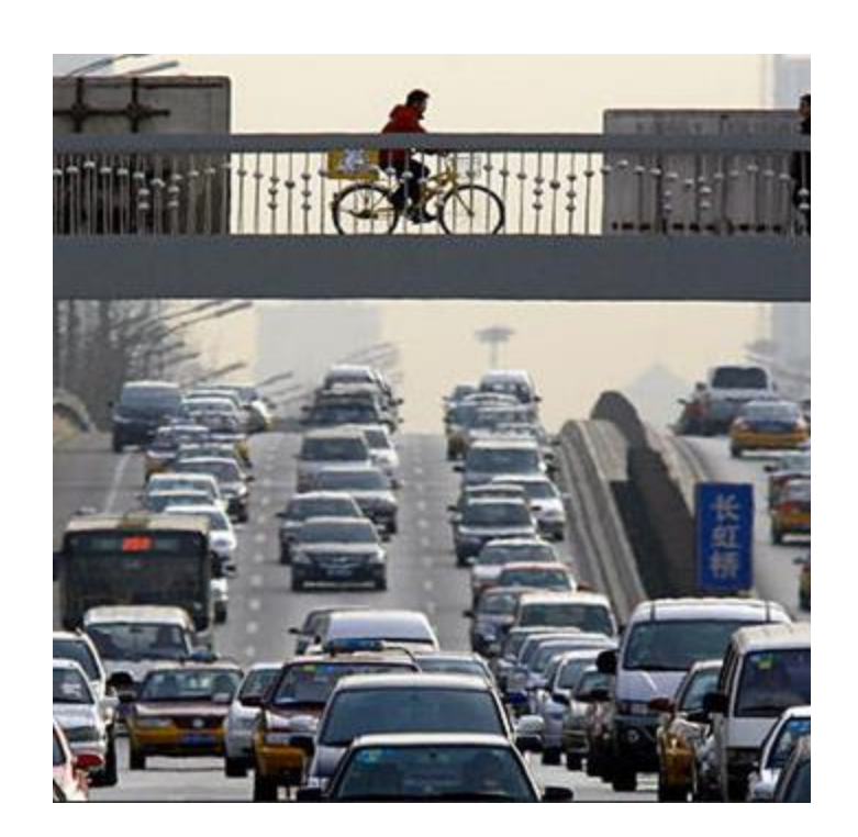
Pedestrian Walkway Bridges in Beijing, China

Steuteville, Robert. "Ten Social Benefits of Walkable Places." CNU, 4 Apr. 2023, www.cnu.org/publicsquare/2021/08/12/we-shape-our-cities-and-then-they-shape-us.