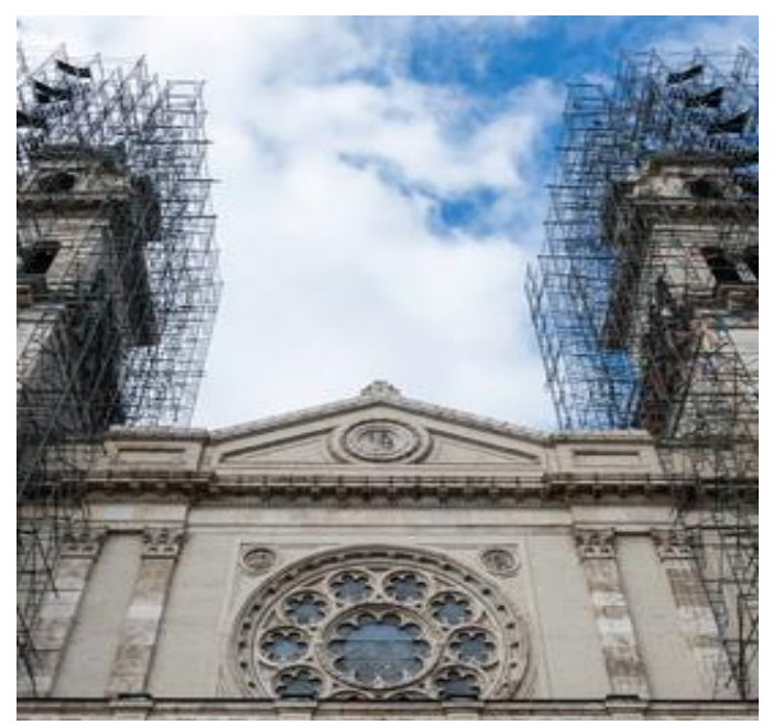
St. Adalbert Catholic Church- Chicago IL

Historic Preservation has numerous cited benefits. First and foremost, it can serve to educate communities on cultural heritage of a city, or even serve as an established center of education, such as a museum. Historic preservation is also good for the planet , as it effectively reuses non-renewable resources. Historic preservation also can increase tourism, and better a place's economy.