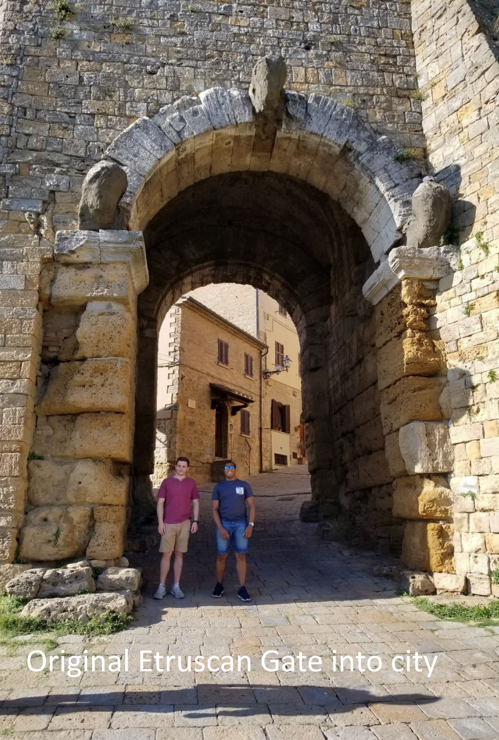
Original Etruscan Gate into city