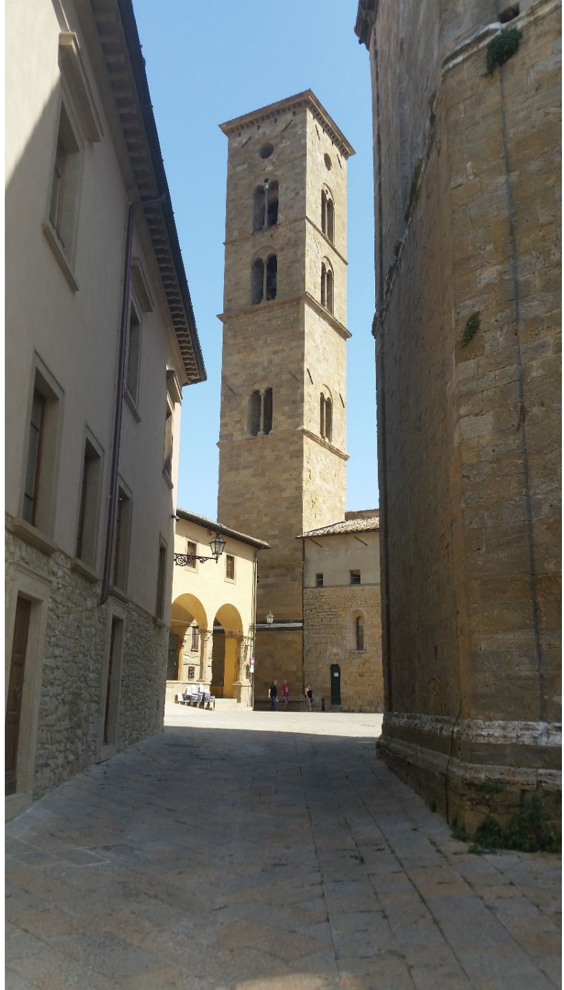
Volterra Medieval Context