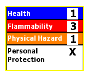
HMIS RATINGS (0-4)