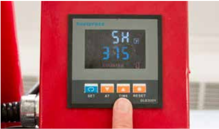
Fig 2 - Setting Temperature "SH"