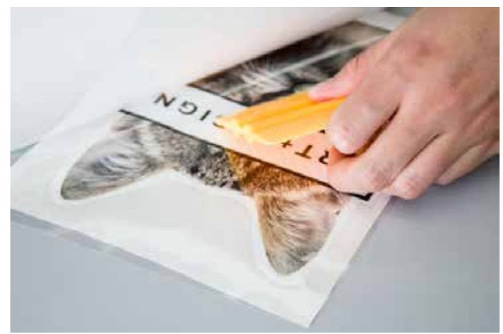
Fig 6 - Apply (clear) application tape on printed vinyl