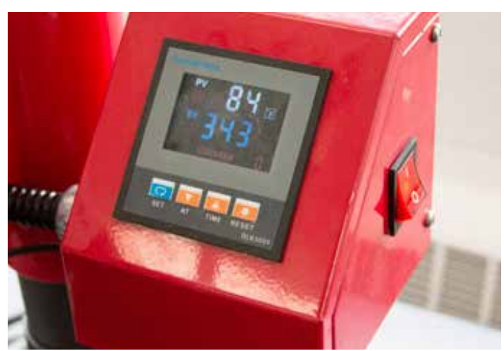
Fig 1 - Control Panel

The display should show "St" (for "set time"). Use the orange up and down arrow buttons to increase or decrease the number of seconds for the timer.