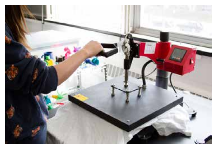
Fig 9 - Pressing fabric