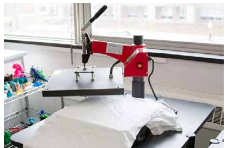
Fig 4 - Swing arm and pressing out moisture.

For printed vinyl, after unwanted area(s) is weeded, apply (clear) heat press application tape over complete image without tiling or creating a seam, and remove back release liner (backing).