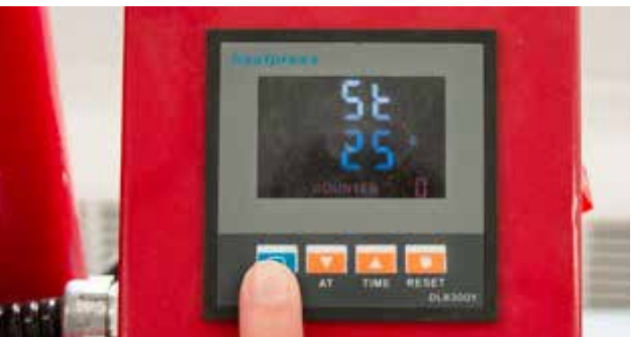
Fig 3 - Setting Timer "St"