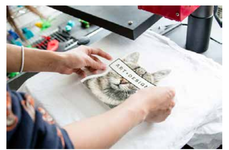
Fig 8 - Placing image