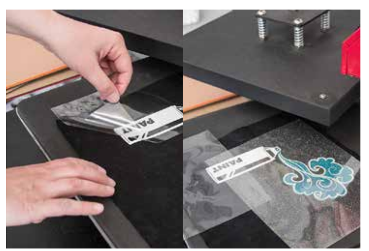
Fig 10 - Layering vinyl

6 If you are only appling one layer of vinyl, press for 15 seconds. If you are layering plain vinyl, press first layer for 1 second, then remove application tape, and apply the next layer. Repeat as needed. Press final composition for 15 seconds (make sure all vinyl is covered with application tape).