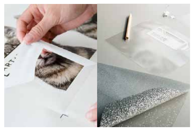
Fig 5 - Weeding unwanted area of image

2 The press top swings to the side to allow for easier manipulation of the materials. Lay fabric on press base and smooth out any wrinkles. Press fabric only (without print) for 5-10 seconds to remove any moisture from fabric.