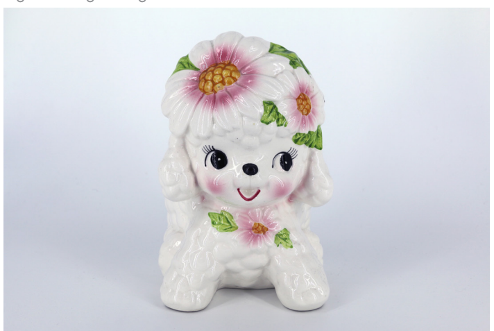
Fig 2 - Light Tent Sample Shot