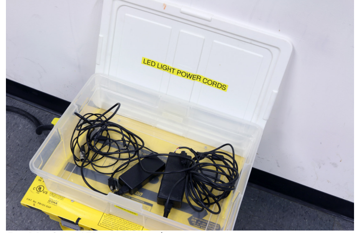
Fig 11 - Store LED power cords