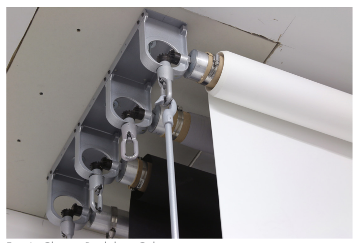
Fig 4 - Choose Backdrop Color

2 If shooting on the table top, roll the paper gently over the top, being careful to avoid creasing the paper. Position the paper so that it hangs straight down and has a gentle curve down to the flat surface of the table. Place several books or other weights on either end of the table to hold the paper in place.