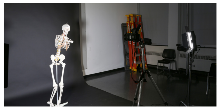
Fig 6 - Camera/Light Setup for large work