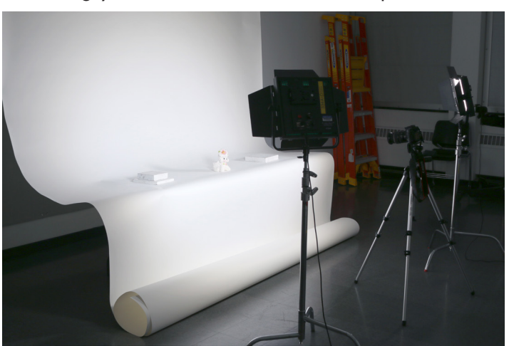
Fig 7 - Camera/Light Setup

3 Set your object on the flat portion of the paper as far forward from the bend of the paper while still filling your frame with the backdrop.