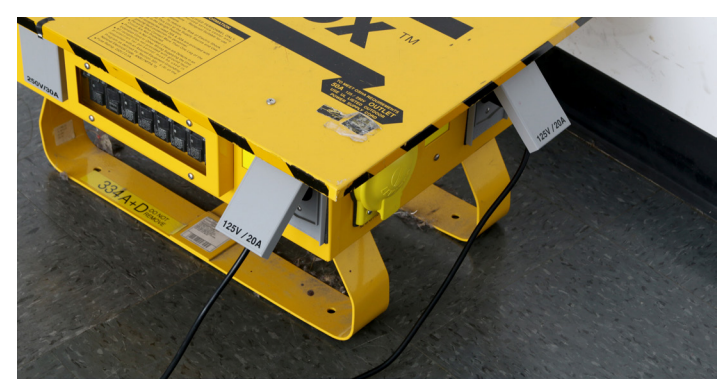
Fig 8 - Studio Power Breaker