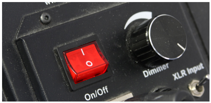
Fig 9 - Power Switch