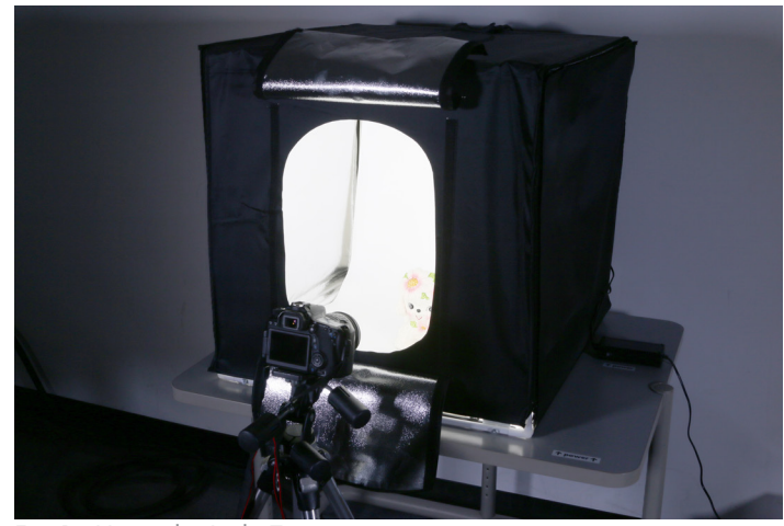
Fig 1 - Using the Light Tent